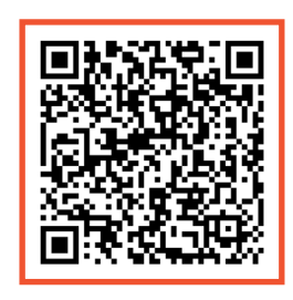
<u>Click here</u> or scan to check it out!